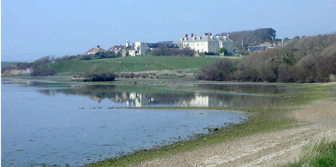
Our hotel on the shores of the Fleet