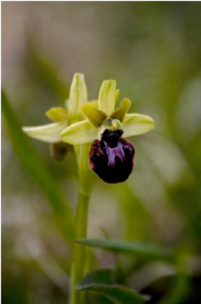
early spider orchid

On a cold and breezy afternoon birds were difficult to find but we did manage brief views of Jay, Bullfinch and Whitethroat. The orchids were the real stars here with Early Spider, Early Purple and Green-winged all seen in good numbers.