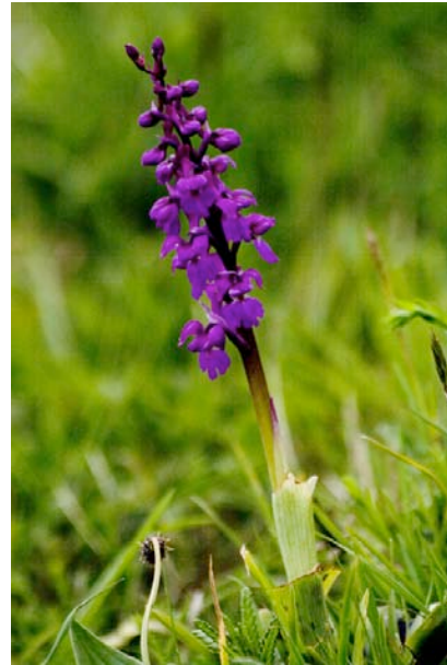
early purple orchid