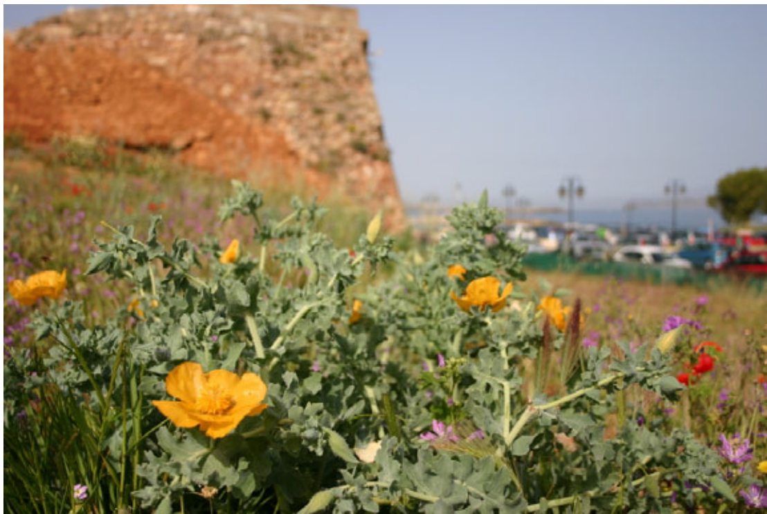
Yellow horned poppies on waste ground in Chania

It was very warm and sunny when we arrived in Chania. We were dropped off just west of the Venetian harbour by the fort. We immediately spotted the endemic Cretan wall lettuce , henbane and Malcolmia maritima in the ancient stonework, and a colourful piece of wasteland with yellow horned poppies , corn poppies and common mallow .