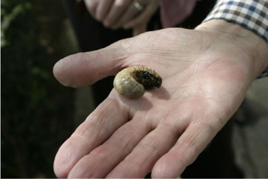
The huge beetle larva at Venezelou Graves

We ate our lunch at Venezelou's Graves a park overlooking Chania and enjoyed local cheese from the market and Rakomelo (raki sweetened with honey) with our packed lunch. Highlights here were the enormous beetle larva which could only have been that of a stag beetle , soft and vulnerable without its protective tree trunk home. We also had views of a Serin feeding on the grass but some way off.