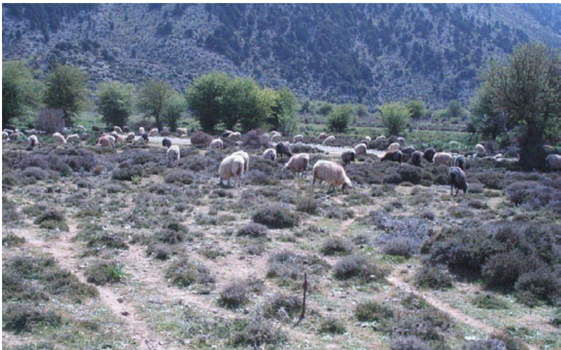
Grazing sheep at Omalos (Angela Witherby)

We lunched in the shade at the head of the Samaria Gorge where there were breath-taking views of the mountains, still with small snow patches. We noted a new visitor centre for the national park, which was not yet open. The Peone clusii was in perfect full bloom by the cafe.