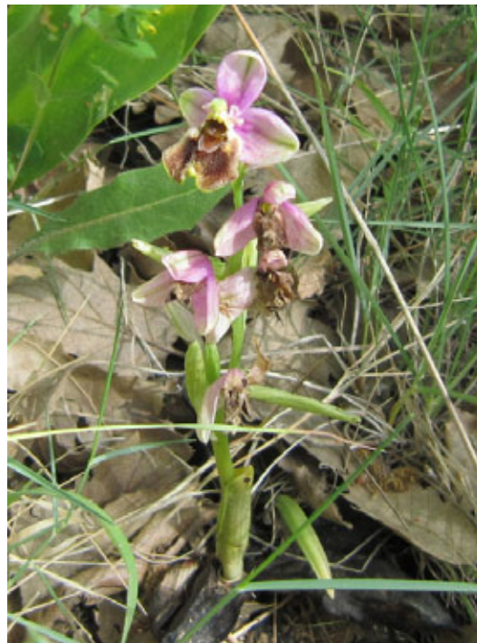
Large flowered bee or hybrid? (David Tristram)

We set out early for our day at the gorges, stopping first at the Petres river mouth where we saw a Kingfisher and identified Thymelea . The late Minoan cemetery at Armeni looked glorious with a great variety of flowers in the ungrazed Vallonia Oak woodland. Here we found our first Orchis and Ophrys orchids. There were good shows of naked man orchid , well camouflaged yellow bee orchids and golden drop or Onosma . We photographed a curious orchid which turned out to be a hybrid of large flowered bee ( Ophrys episcopalis ) and Heldreich's .