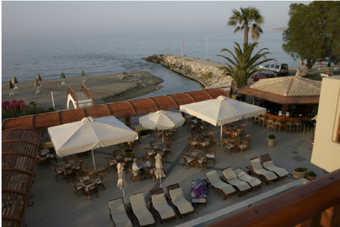
Kalyves Beach hotel