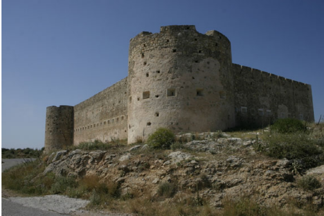
Turkish fort at Aptera

After a brief excursion into Chania to see if we could locate the Botanic garden of the Mediterranean Agronomic Institute (which also hosts a virtual botanical museum www.maich.gr/ ) we decided to return to Aptera. Here we began at the Turkish fort perched 230m up overlooking Souda bay, where we found fringed rue .