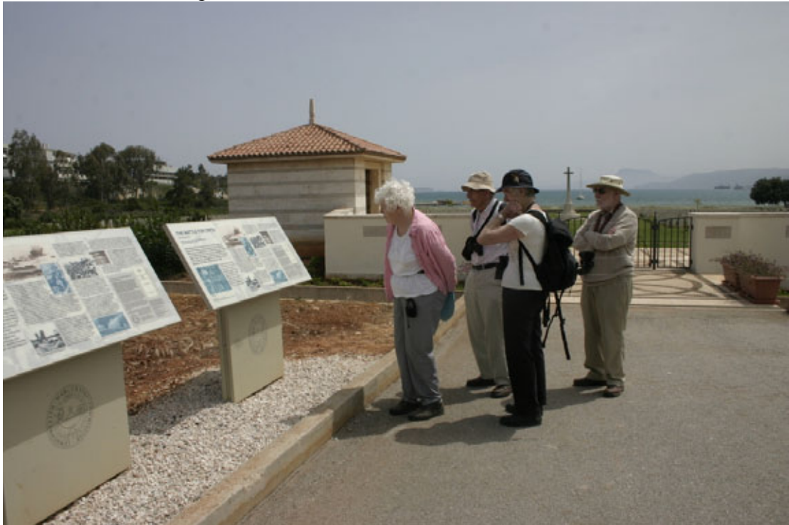
Visiting Souda Bay War Cemetery

At the Moronis River mouth we followed the river bank walk to the sea at Souda bay stopping to watch the Black Winged Stilt, Common Sandpipers and a Greenshank . Various saltmarsh plants were found here, including sea and sharp leaved rush . In the wild area by the cemetery we found numerous tongue orchids, rose garlic and wild hairy lupin . We spent some thoughtful time in the Souda Bay British War Cemetery where we found the grave of John Pendlebury, who was a respected archaeologist, worked with Cretan resistance and had an important role in the Battle for Crete.