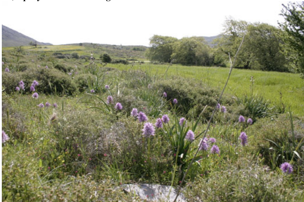
Spili orchid hill with naked man orchid

Our special destination for the day was the plateau above Spili where we took a long winding road up through woodland and maquis to farmland where we stopped and looked at and photographed the spectacular red tulips ( Tulipa doerfleri ). After walking through the fields with vivid lime green perfoliate alexanders we crossed the stream onto the little hill. Here botanists from around the world were marvelling at the range and profusion of orchids, with opportunities to tell those who joined our group about Travelling Naturalist tours. Groups of naked man orchid were most conspicuous but among the orchids were woodcock, brown bee, Bory's, rainbow and yellow bee . We also found clumps of leaves from Iris unguiculata . Photos examined later revealed other orchid species Orchis anatolica, Ophrys sitiaca and large flowered bee .