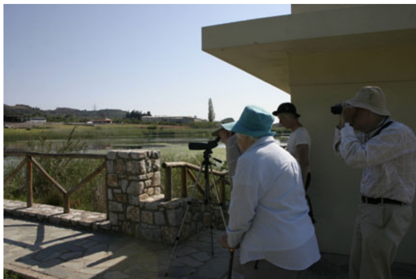
Bird watching at Agia lake

We hired a vehicle for what proved to be our last day. First we drove to Agia lake again and saw many of the same birds but also a Marsh Harrier flew low overhead giving everyone excellent views. We also walked round the lake to the back of the Church recording lax-flowered orchid and corky fruited waterdropwort in a patch on uncut meadow. Where the grass was being strimmed Western Yellow Wagtails were collecting the insects. While we were here we heard that we had seats on the 10.25 pm flight that night. Then we went and sipped orange juice at the larger restaurant overlooking the lake where a Ruff fed on the lawn. We lunched at the picnic site near the Agia church and enjoyed hot sunshine.