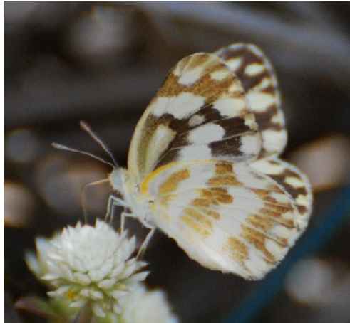
Zebra White (AL)