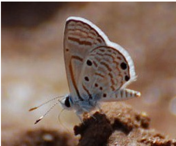
Desert Babel Blue