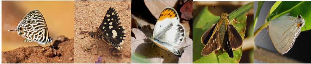
Tiger Blue sp. Dromus Grizzled Skipper Tiny Orange-tip Twin Swift Purple-brown Hairstreak