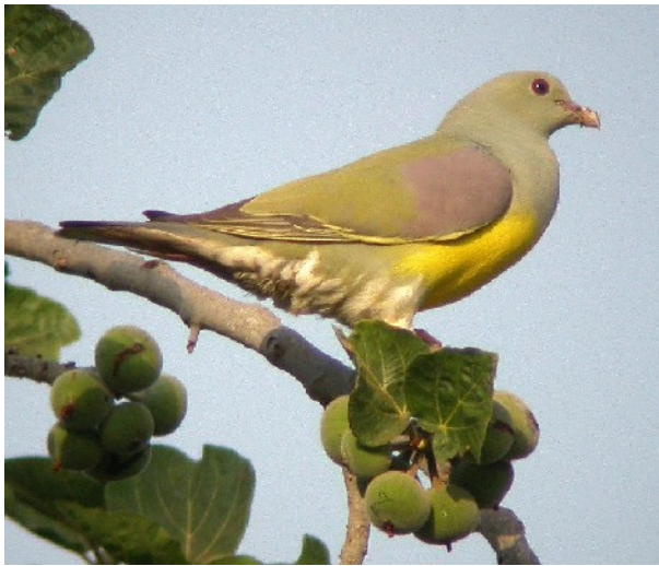
Bruce's Green Pigeon

Photo gallery : a random selection of Senegambia wildlife / scenes