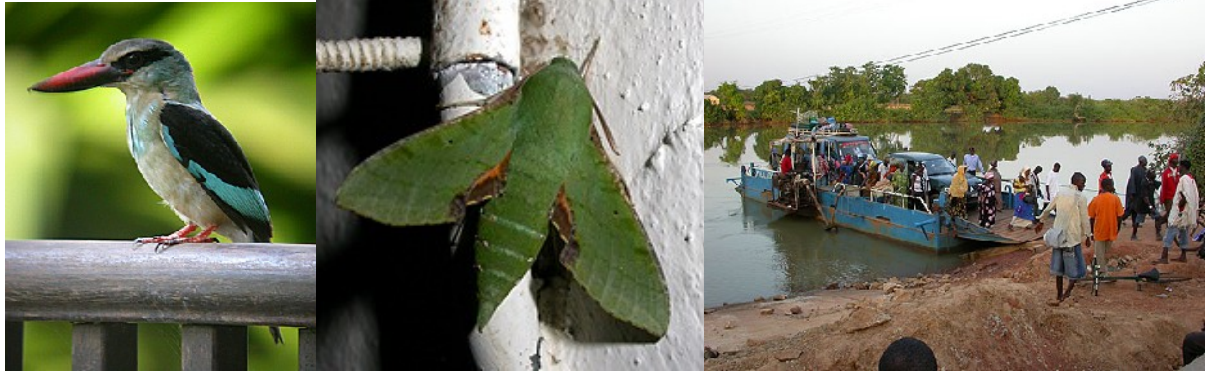
Blue-breasted Kingfisher Green Hawkmoth sp. Georgetown hand-pulled ferry