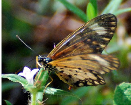
Orange Acraea (different morph) (AL)