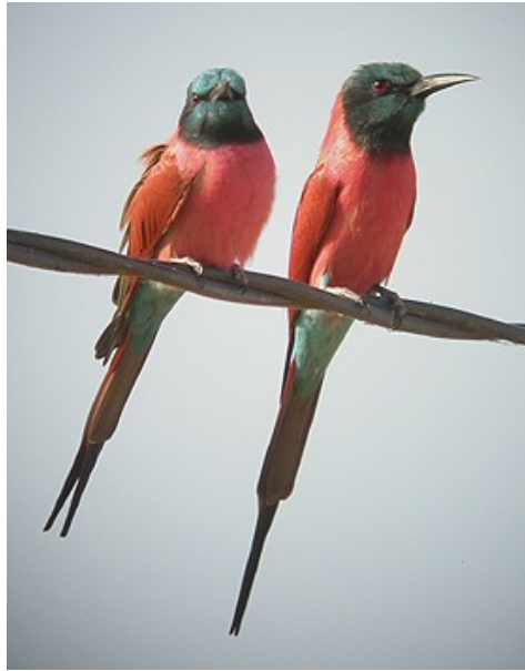
Northern Carmine Bee-eaters