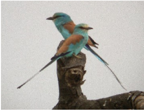
Abyssinian Roller pair