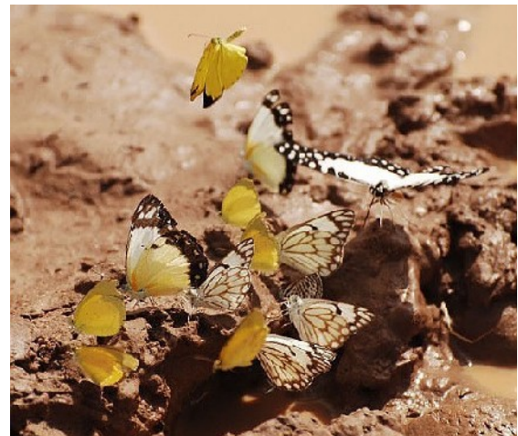
Common & Small Grass Yellows, Caper & African Caper Whites, White Lady Swallowtail