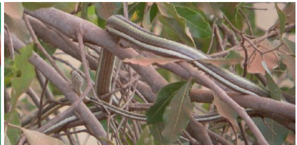
Slender African Beauty Snake