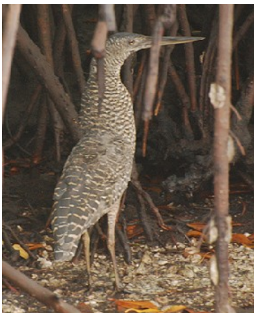
White-crested Tiger Heron (AL)