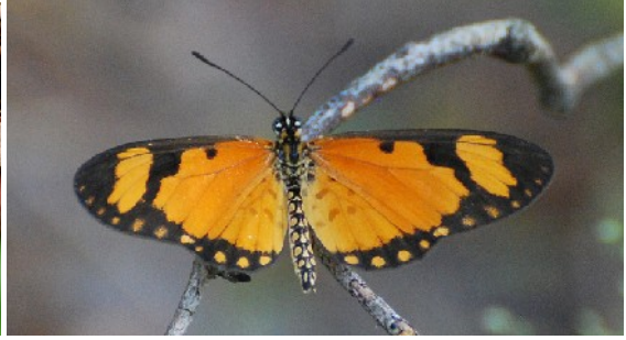
Orange Acraea (AL)