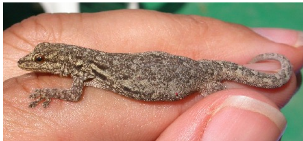
Daytime / Ugandan Dwarf Gecko