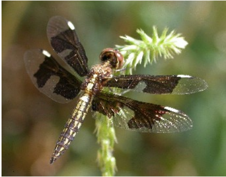
Palpopleura portia female