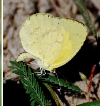
Eurema brigitta (AL)