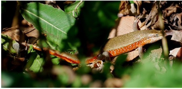
Male Red-flanked Skink (AL)