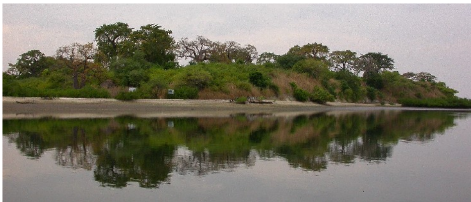
Keur Saloum Delta woodland (including Baobabs)