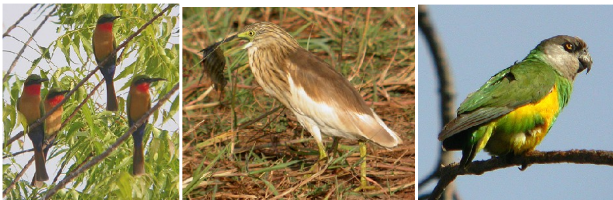
Red-throated Bee-eaters Squacco heron + Tilapia Senegal Parrot