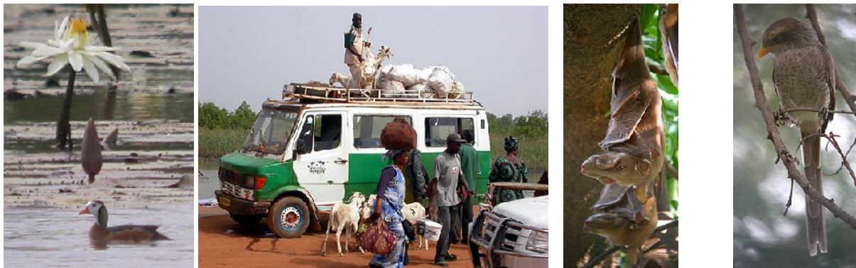
African Pygmy Goose How to get a ram off a roof-rack! Gambian Fruit Bat Yellow-billed Shrike