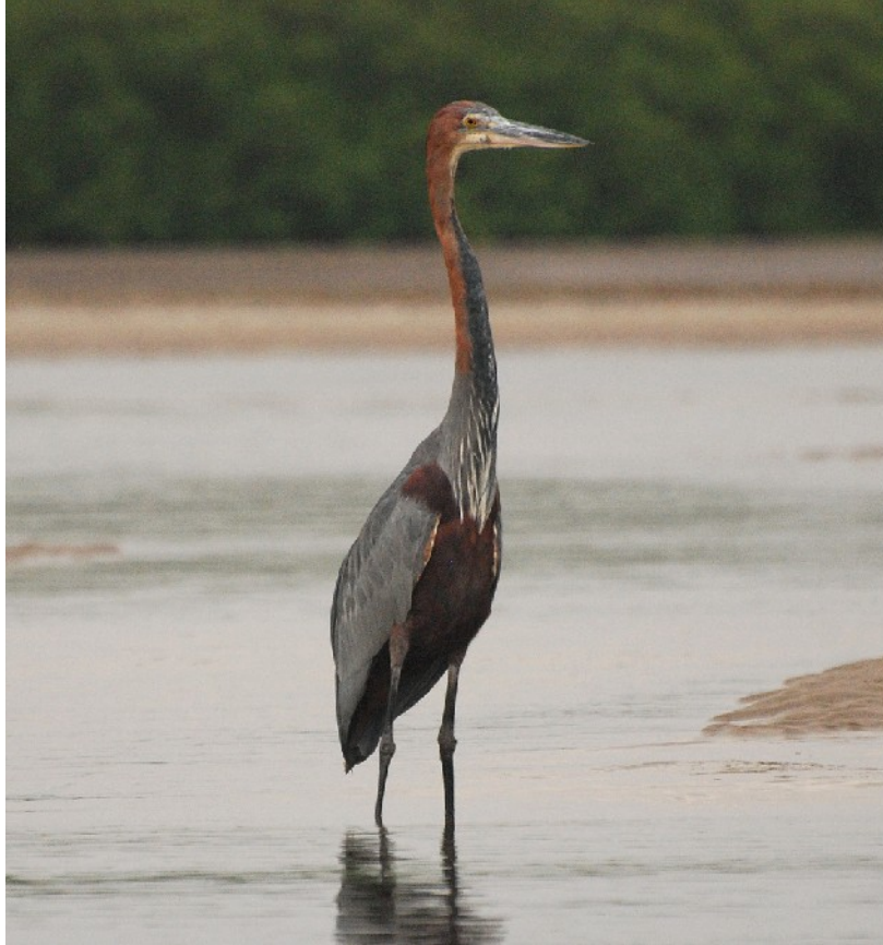
Goliath Heron