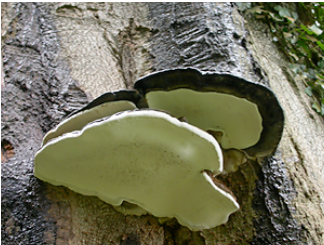
Artist's fungus Ganoderma europaeum