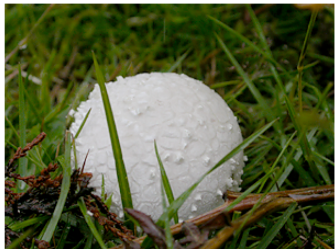
Puffball Calvatia utriformis

After lunch back at the hotel we were all still drying out so we decided to avoid another soaking and instead spent a fascinating afternoon at the New Forest Centre in Lyndhurst.